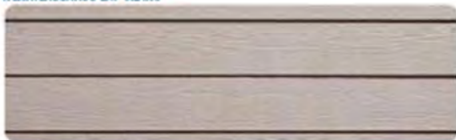
Cedar Lap Siding 8-1/4" x 12"