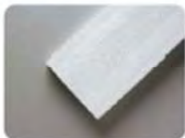
Composite Trim - Reversible Textured/Smooth 1" x 4" x 12, 1" x 6" x 12 (nominal)